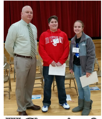
JH Champion &

Congratulations to all of our top spellers in the elementary and junior high who participated in the Spelling Bee! A special thanks goes out to our guests, judges, and staff members who gave their time and encouragement to our Tri-Village students. They helped make the Spelling Bee a success! Thank you! Participants